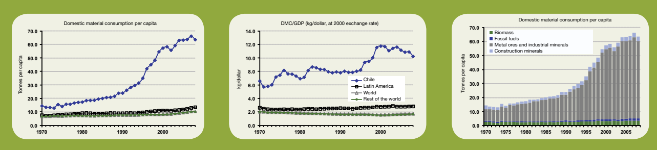
Figures 2a, 2b, 2c. Graphic overview of flow and intensity of materials in Chile

Chile has the highest DMC and MI in the region (Figure 2a, 2b), due to an enormous increase in the extraction of metal ores and industrial minerals for export (primarily copper). However, Chile also has a large forestry sector, which accounts for 20% of the country's exports (FAO, 2009).